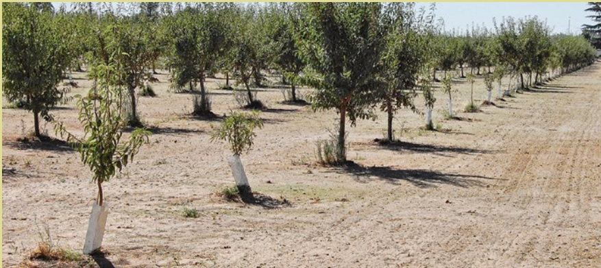
Ring nematodes can predispose almonds to bacterial canker