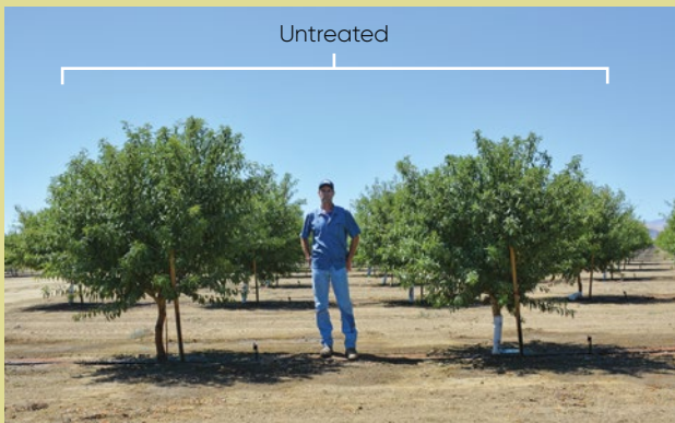
▲ 2nd-leaf almonds planted at same time in same block. Field previously in grapes. ▲