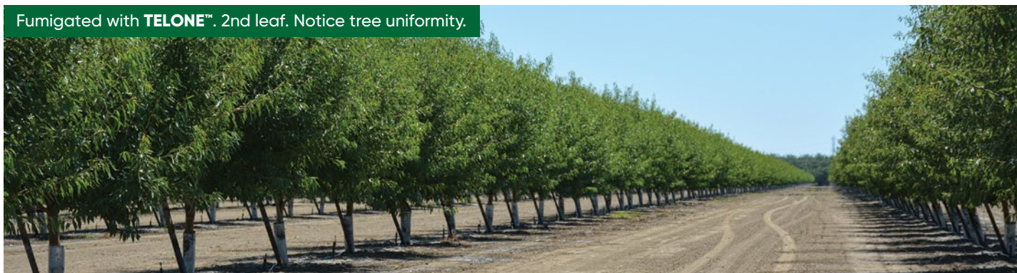
Fumigated with TELONE™. 2nd leaf. Notice tree uniformity.

The most efficient use of these inputs – so that there is little overuse or underuse – requires uniform plants. That's where soil fumigation can help. Replant disease and nematodes can be scattered throughout a field. Nematode "hot spots" are common. These hot spots create areas of an orchard or vineyard where plant growth is different. In a non-uniform crop, either some plants get shortchanged or some inputs are wasted. TELONE™ soil fumigant can help create uniform root systems that lead to above-ground growth that is also uniform.