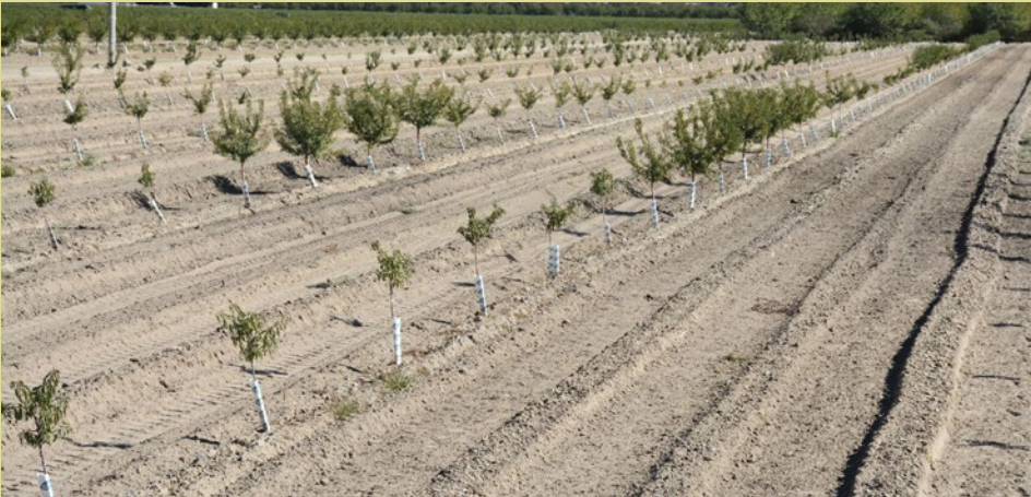
Fresno County. Almonds-to-almonds replant site. No fumigation. Photo taken eight months after planting. Notice lack of uniformity throughout field.